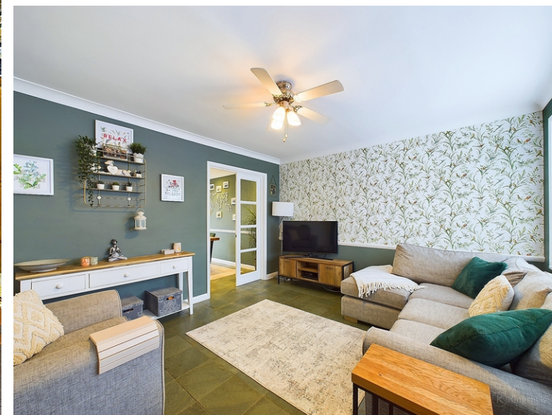
Farndale Gardens, Hazlemere, High Wycombe, Buckinghamshire, HP15 7HE