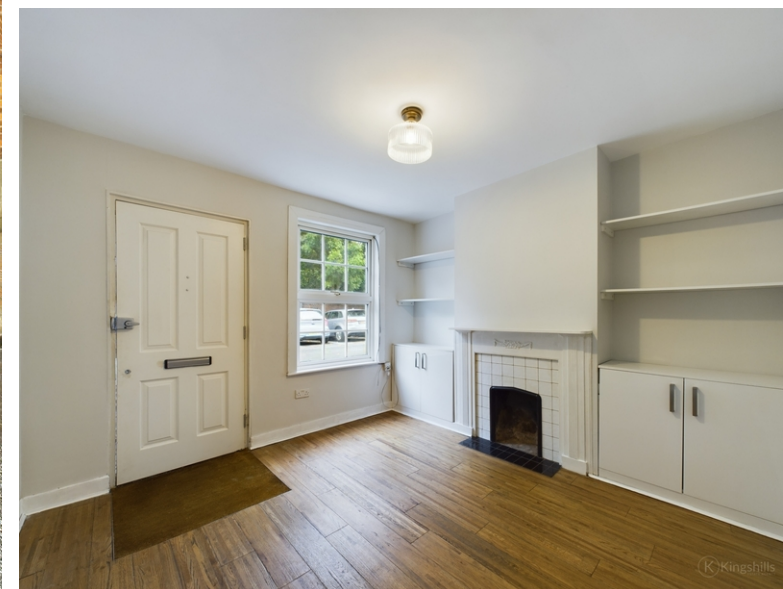
68 Temple End, High Wycombe, Buckinghamshire, HP13 5DS