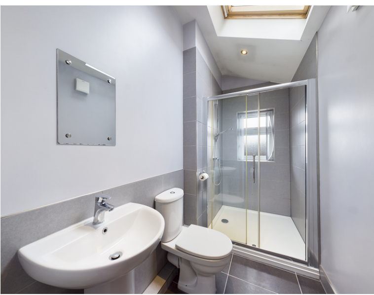
Room 3 37 Guinions Road, High Wycombe, HP13 7NT