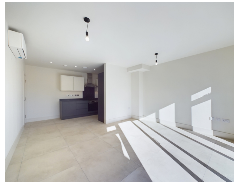
Flat 1, Sands House, 65-67 Chapel Lane, High Wycombe, Buckinghamshire, HP12 4BS