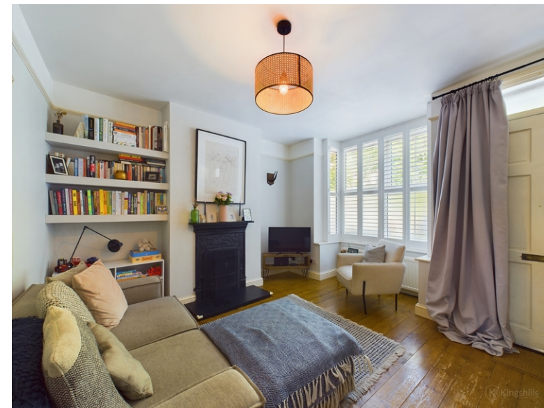
171 Hughenden Road, High Wycombe, Buckinghamshire, HP13 5PN