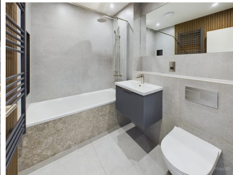
Sands House, Chapel Lane, High Wycombe, Buckinghamshire, HP12 4BS