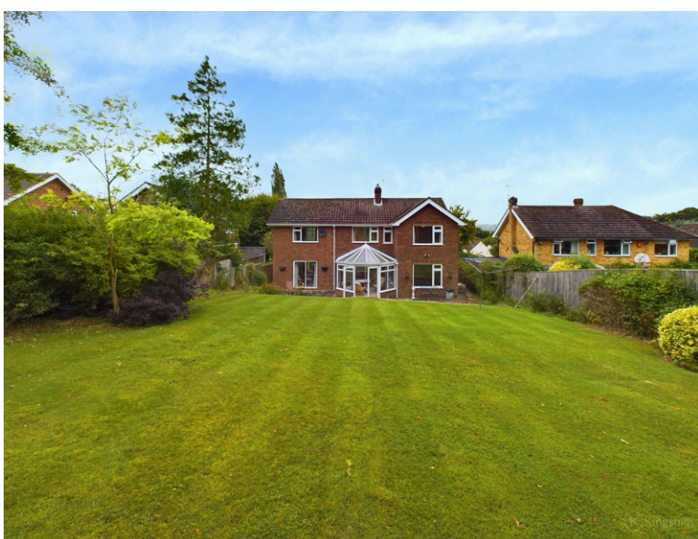
29 New Road, Little Kingshill, Great Missenden, Buckinghamshire, HP16 0EZ