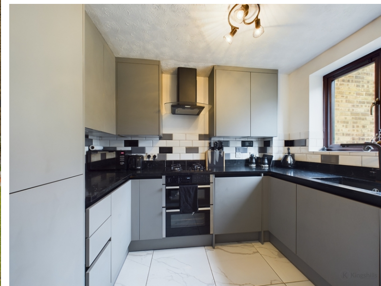
Garratts Way, High Wycombe, Buckinghamshire, HP13 5XZ