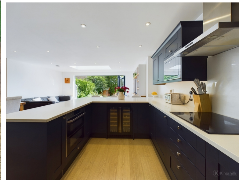
15 Wrights Lane, Prestwood, Great Missenden, Buckinghamshire, HP16 0LH