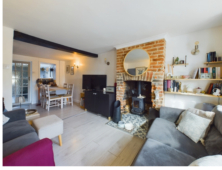
April Cottage, 199 Main Road, Naphill, High Wycombe, Buckinghamshire, HP14 4SE