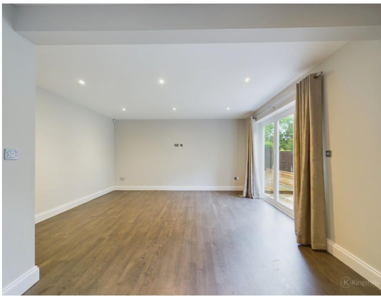
Moreland Drive, Gerrards Cross, Buckinghamshire, SL9 8BB