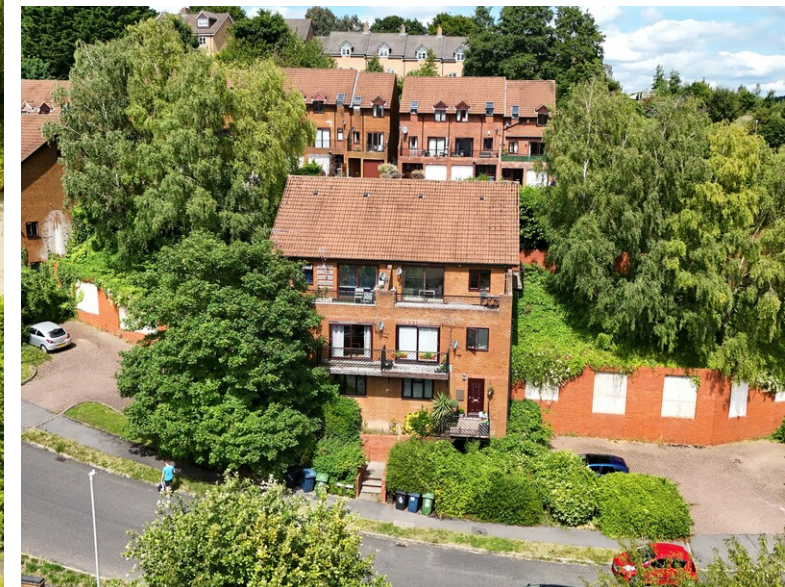
20 Mylne Close, High Wycombe, Buckinghamshire, HP13 5TJ