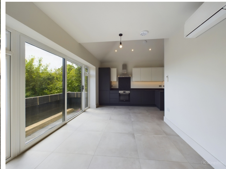
Flat 4, Sands House, 65-67 Chapel Lane, High Wycombe, Buckinghamshire, HP12 4DG