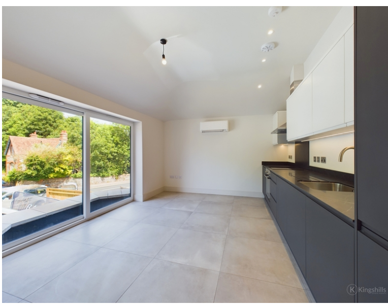
Flat 3, Sands House, 65-67 Chapel Lane, High Wycombe, Buckinghamshire, HP12 4BS