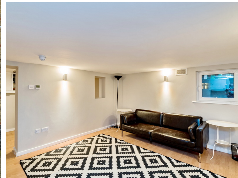
29a Amersham Hill, High Wycombe, Buckinghamshire, HP13 6NU