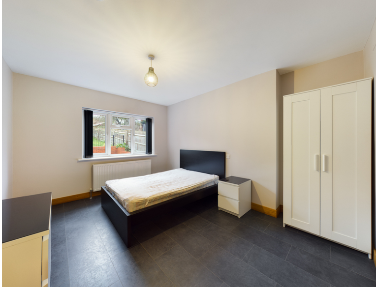
Room 2 37 Guinions Road, High Wycombe, HP13 7NT