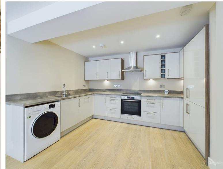
The Malthouse, Church Street, Princes Risborough, Buckinghamshire, HP27 9AA