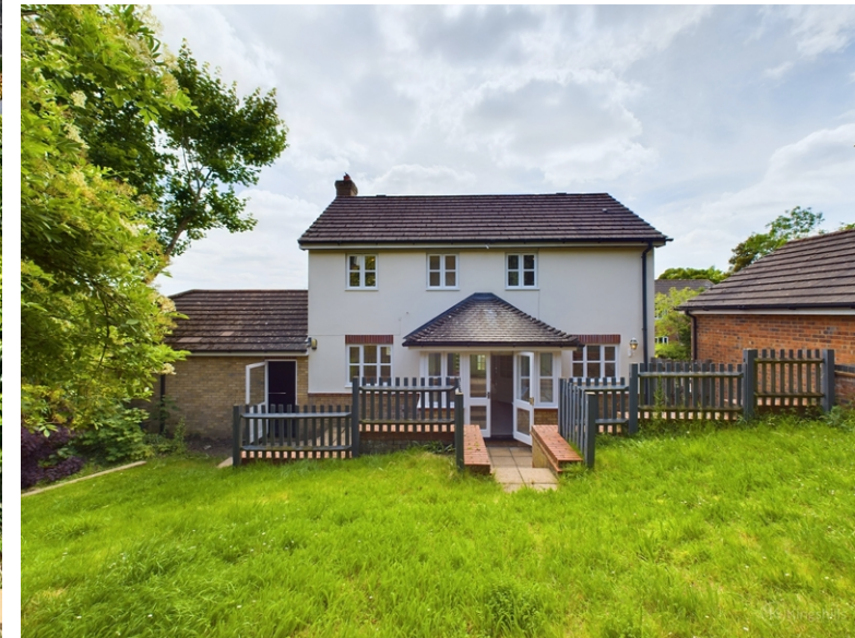
Falcon Rise, Downley, High Wycombe, Buckinghamshire, HP13 5JT