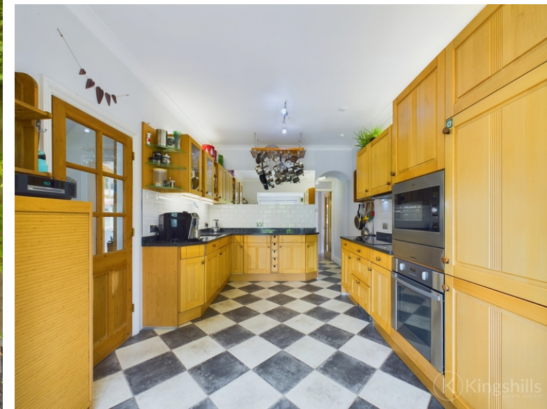
Railway Cottage, Approach Road, Taplow, Maidenhead, Berkshire, SL6 0NP