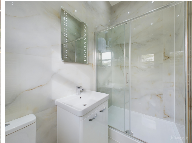
Stuart Lodge, Stuart Road, High Wycombe, Buckinghamshire, HP13 6AG