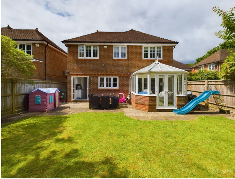
4 Nash Place, Penn, High Wycombe, Buckinghamshire, HP10 8ES