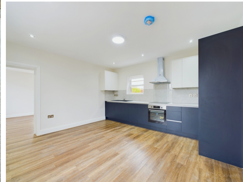
Flat 4 Stuart Lodge, Stuart Road, High Wycombe, Buckinghamshire, HP13 6AG