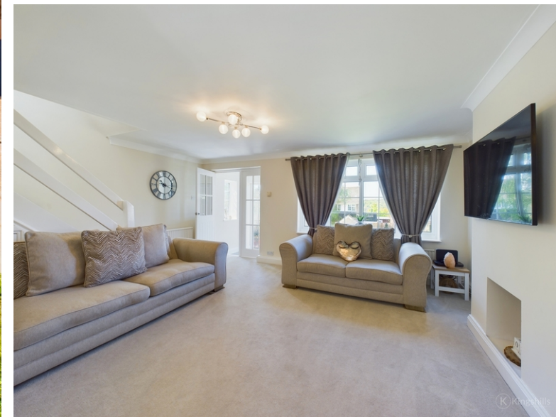
The Rise, High Wycombe, Buckinghamshire, HP13 7BB