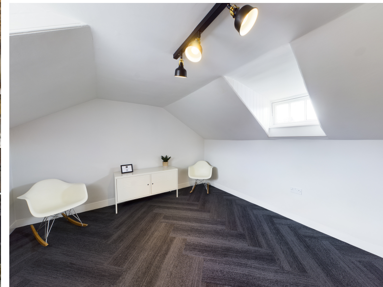
Cubitt, 25 High Street, High Wycombe, Buckinghamshire, HP11 2AG