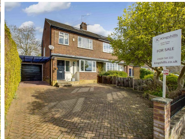
63 Seymour Park Road, Marlow, Buckinghamshire, SL7 3ER