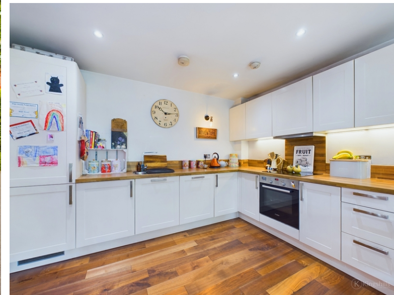
24 Thistle Walk, High Wycombe, Buckinghamshire, HP11 1GZ