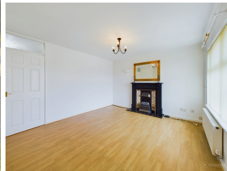
Parsons Walk, Holmer Green, High Wycombe, Buckinghamshire, HP15 6SJ