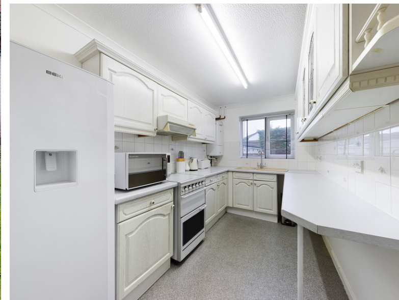
3 Catkin Close, High Wycombe, Buckinghamshire HP12 4UZ