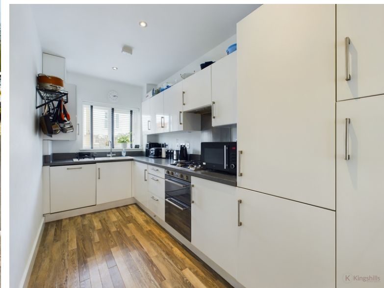
1 Leo Crescent, Princes Risborough, Buckinghamshire, HP27 9FR