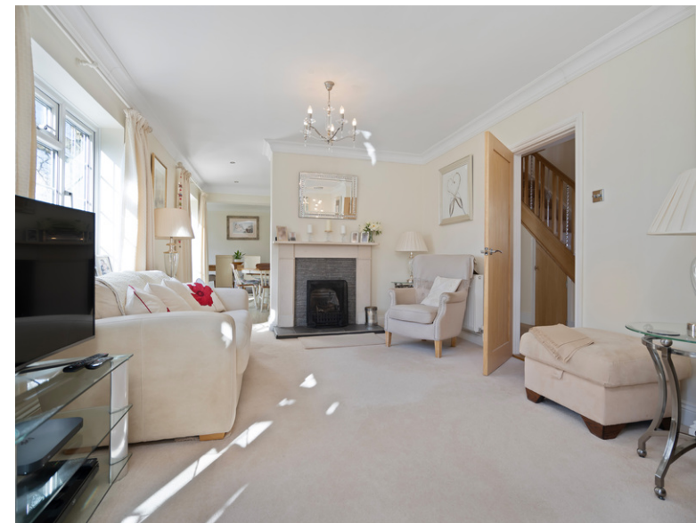
Beacon Hill, Penn, High Wycombe, Buckinghamshire, HP10 8NJ