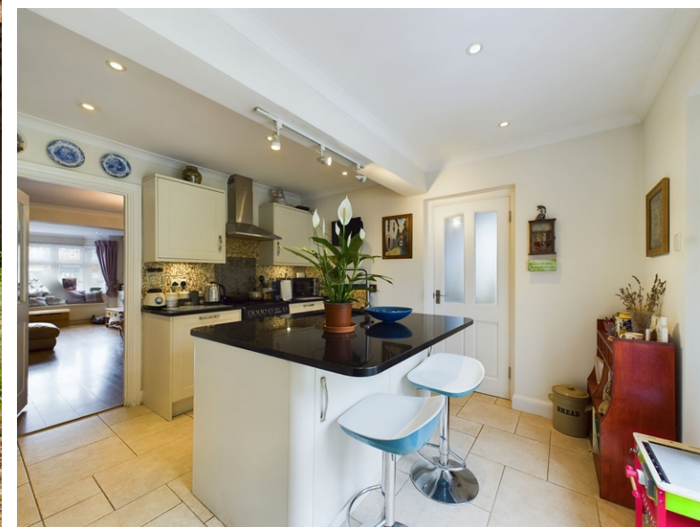
Silverwood, Hedgerley Hill, Hedgerley, Berkshire, SL2 3RL