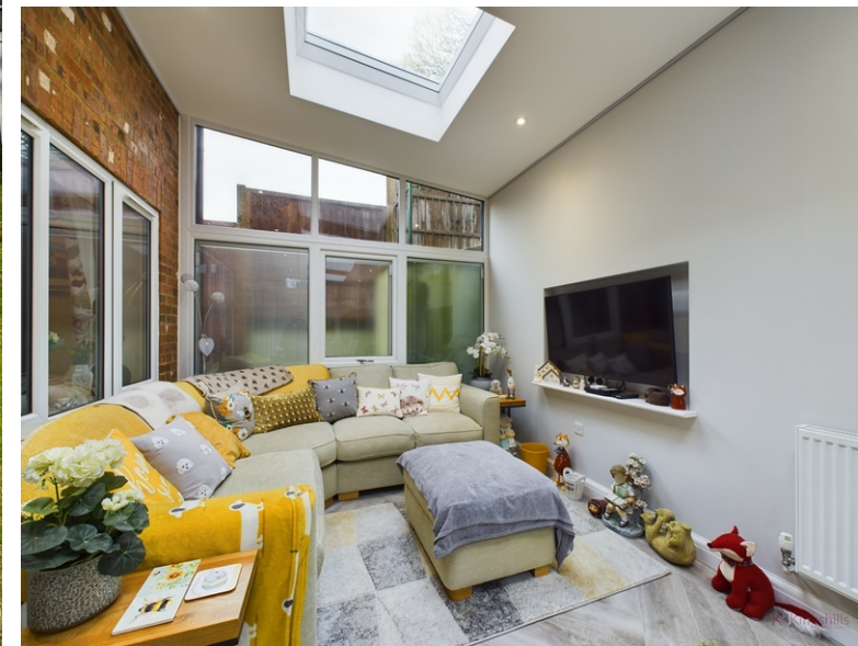
35 Rye View, High Wycombe, Buckinghamshire, HP13 6HL