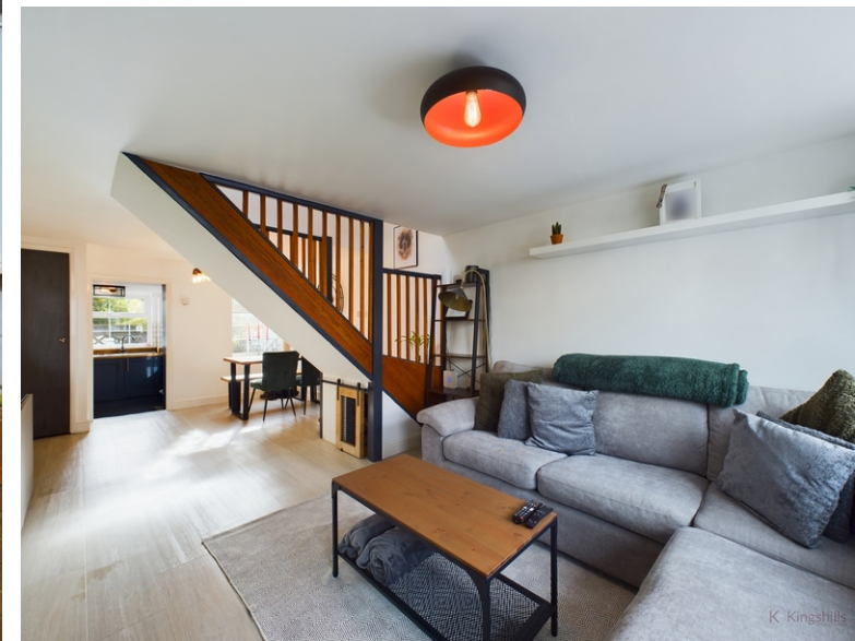
31a Station Road, Loudwater, High Wycombe, Buckinghamshire, HP10 9TX