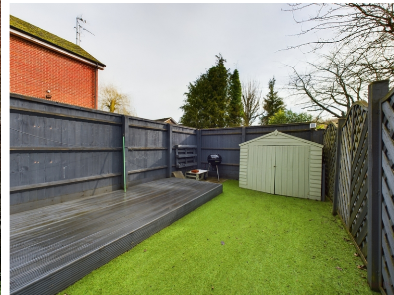
31a Station Road, Loudwater, High Wycombe, Buckinghamshire, HP10 9TX