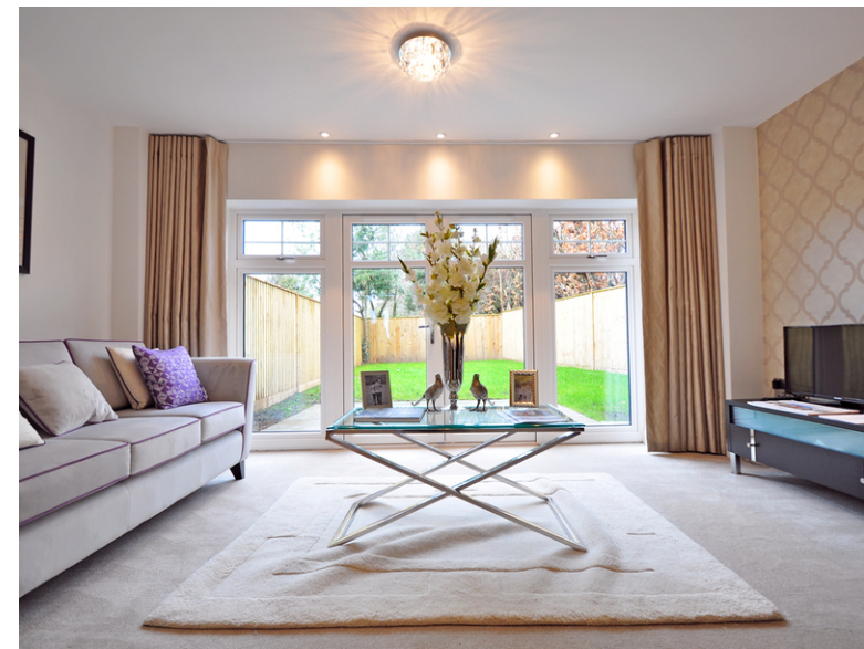
13 Payton Gardens, Cookham, Berkshire, SL6 9FF