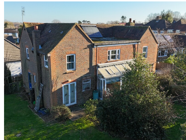
St. Johns Road, Penn, High Wycombe, Buckinghamshire, HP10 8HW