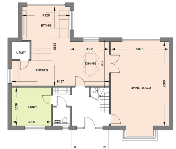
Flora, Chapel Lane, Naphill Common, Naphill, Buckinghamshire, HP14 4RF