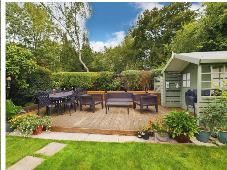
16 Warren Wood Drive, High Wycombe, Buckinghamshire, HP11 1DZ