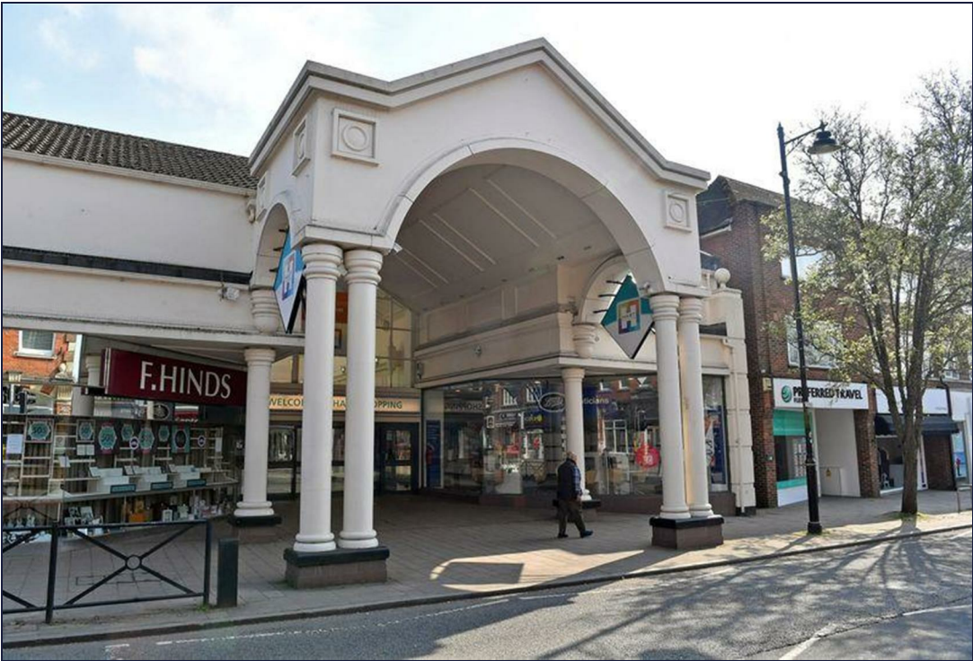
Close to Fleet Town Centre, Fleet Pond & Mainline Train Station