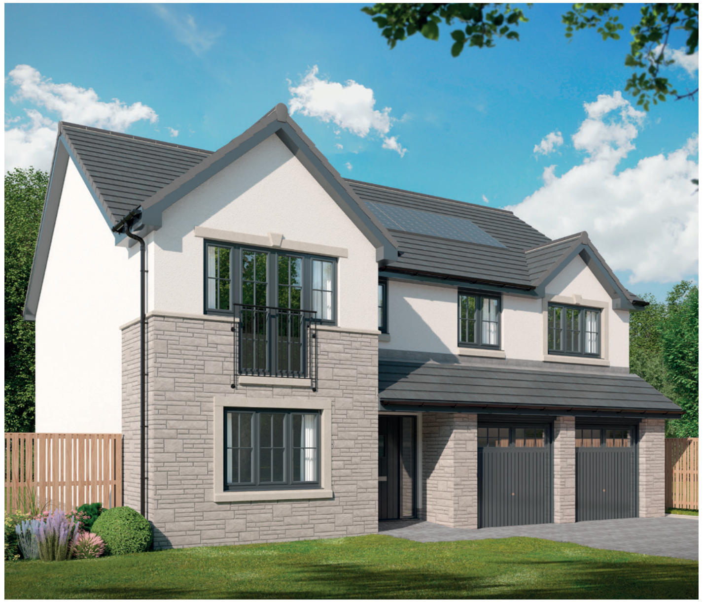
Please \ note \ Photo \ Voltaic \ (solar) \ panels \ shown \ above \ are \ indicative \ only. \ The \ location \ and \ number \ of \ panels \ are \ dependent \ on \ plot \ orientation. \ Please \ see \ Sales \ Advisor \ for \ details \ details \ dependent \ on \ plot \ orientation.

Bellway Homes Limited (Scotland East) 6 Almondvale Business Park Almondvale Way, Livingston, West Lothian EH54 6GA