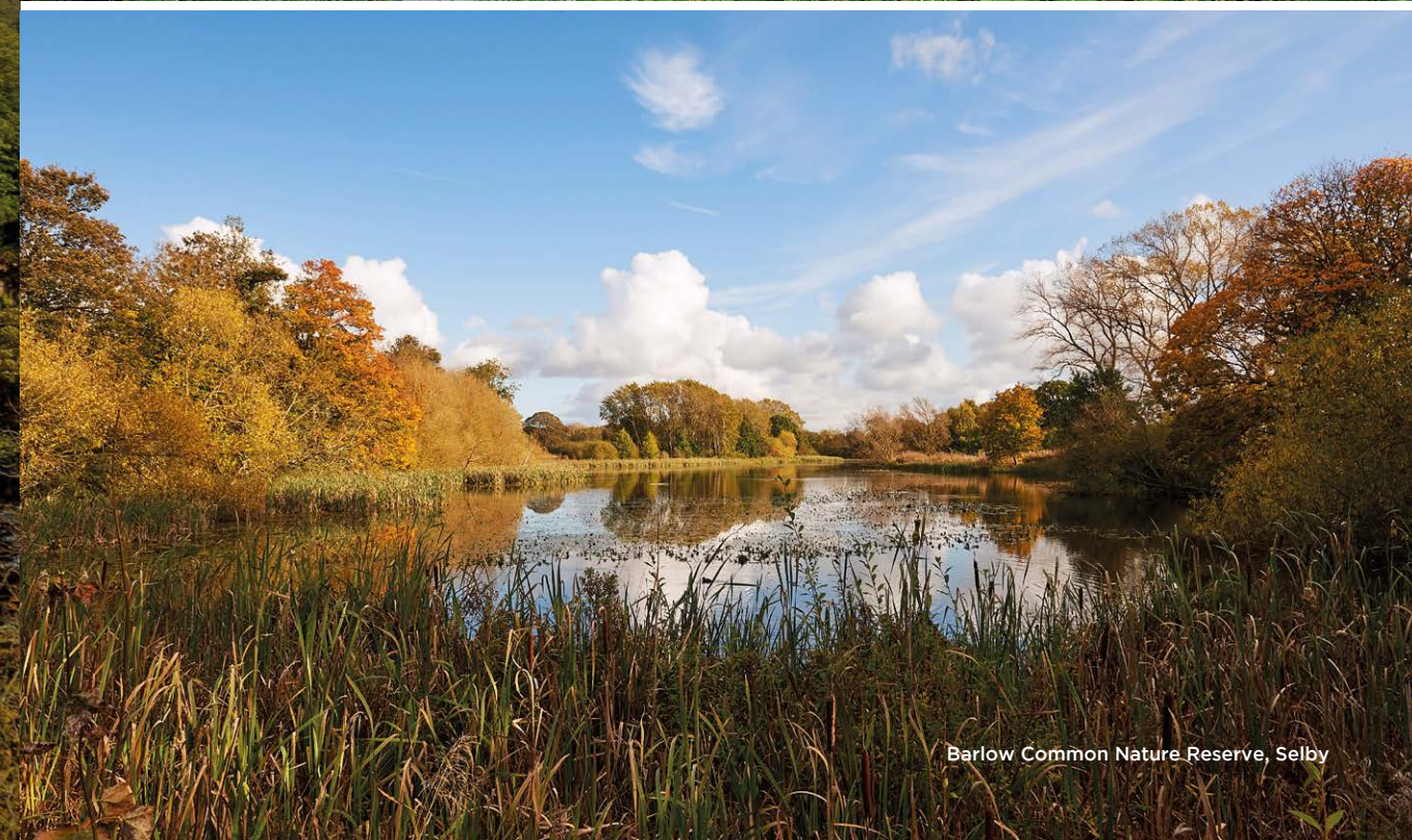
Barlow Common Nature Reserve, Selby