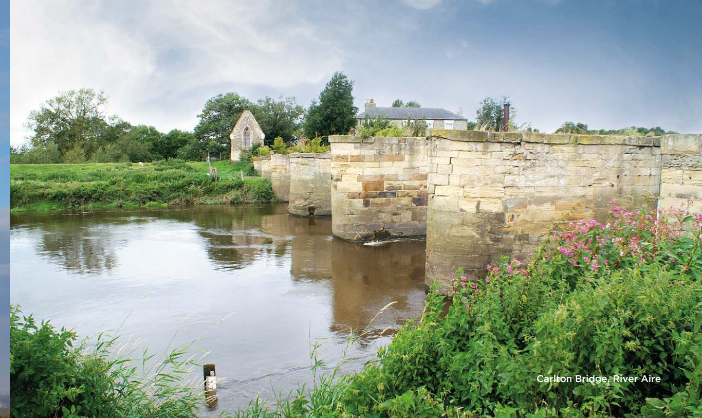
Carlton Bridge, River Aire