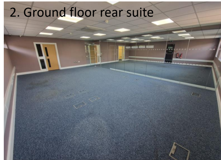
2. Ground floor rear suite