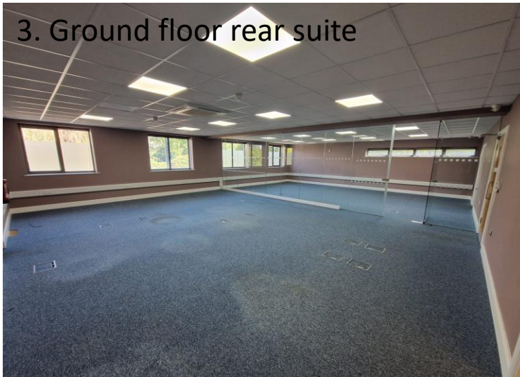
3. Ground floor rear suite