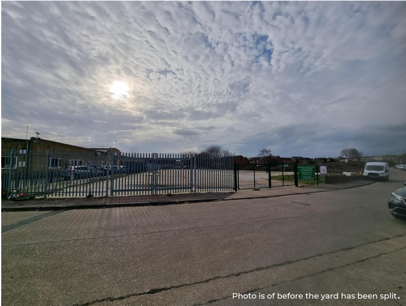
Photo is of before the yard has been split.