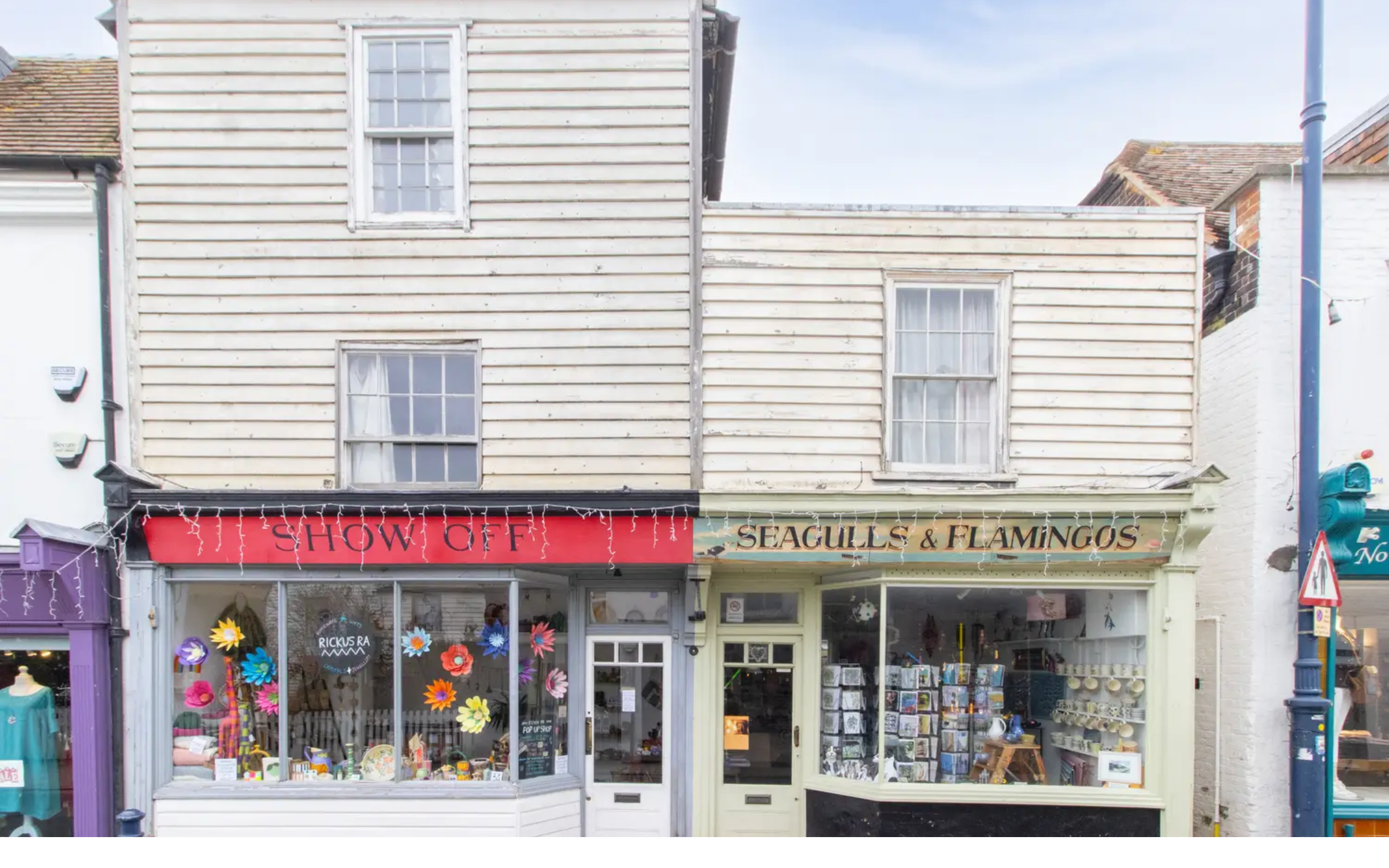
Seagulls & Flamingos, 12 Harbour Street In Excess of £385,000