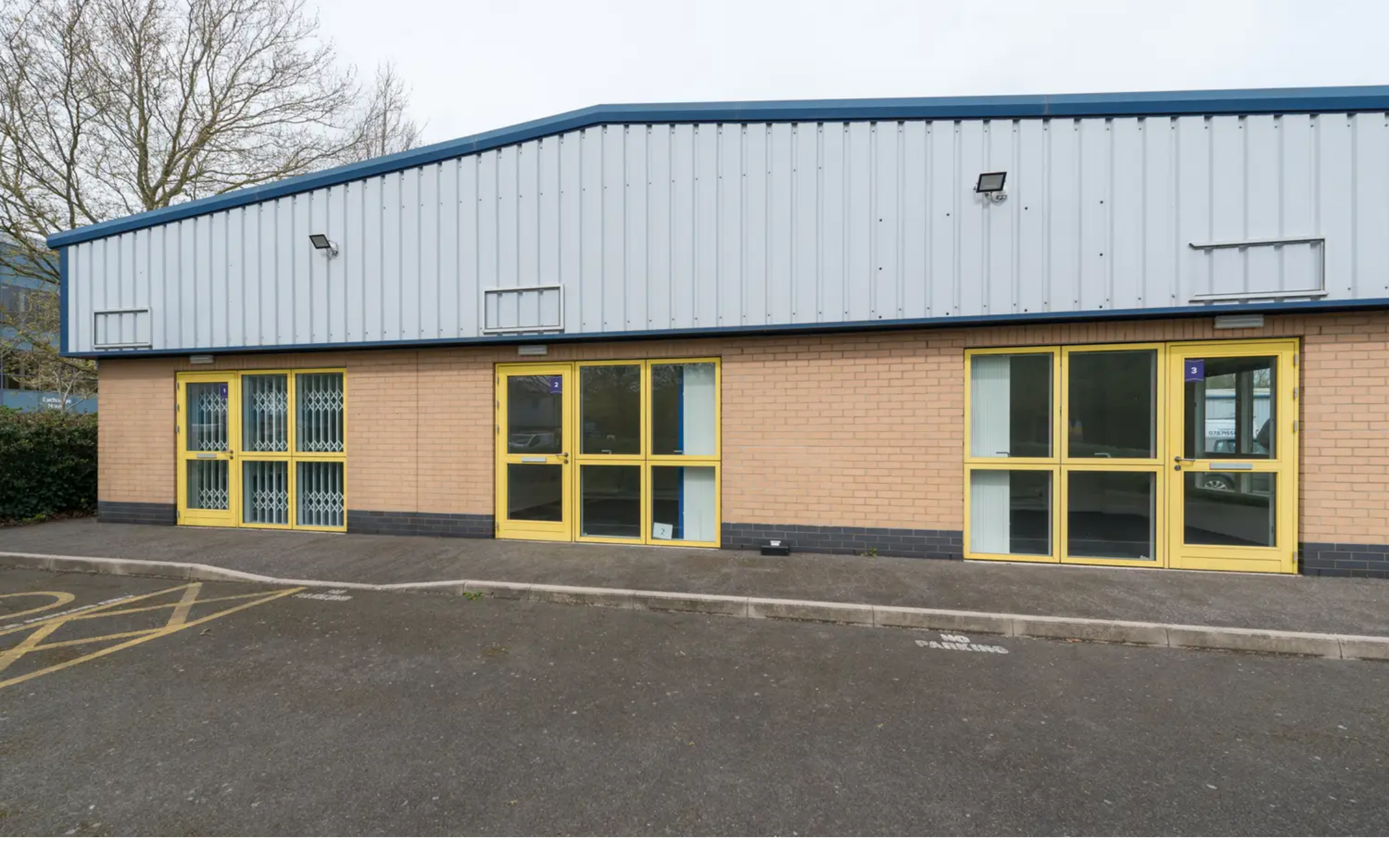
Offices 1-4 Lakesview International Business Park, Hersden £345 pcm