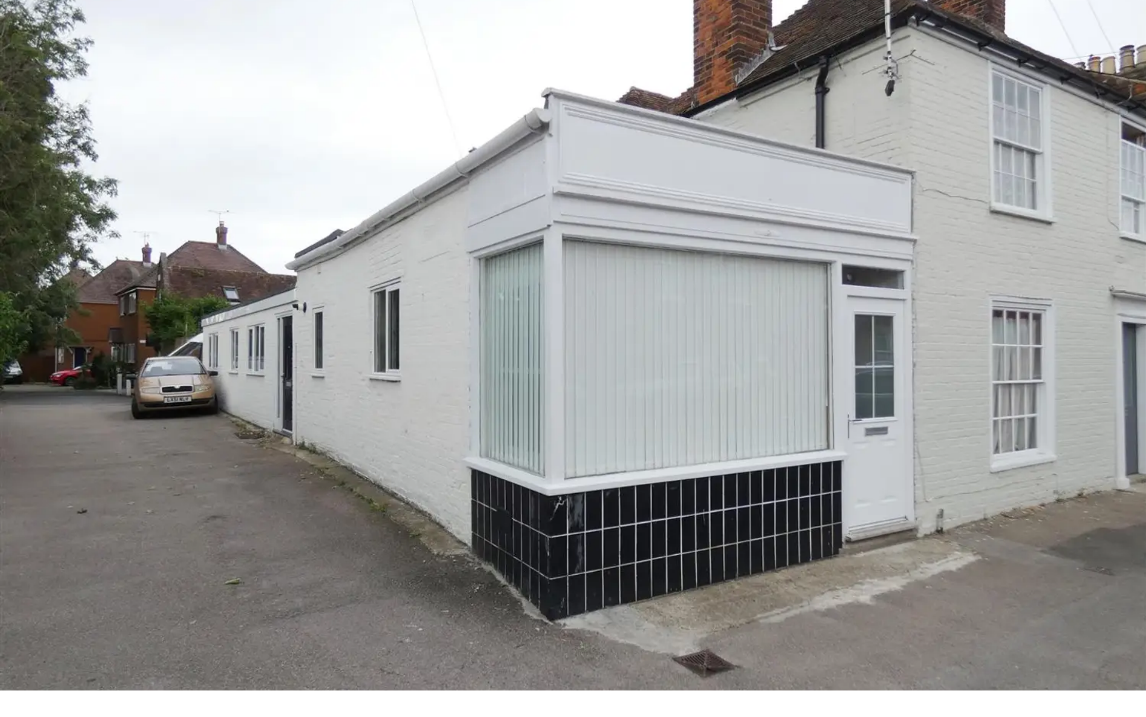
59 High Street, Bridge £155,000