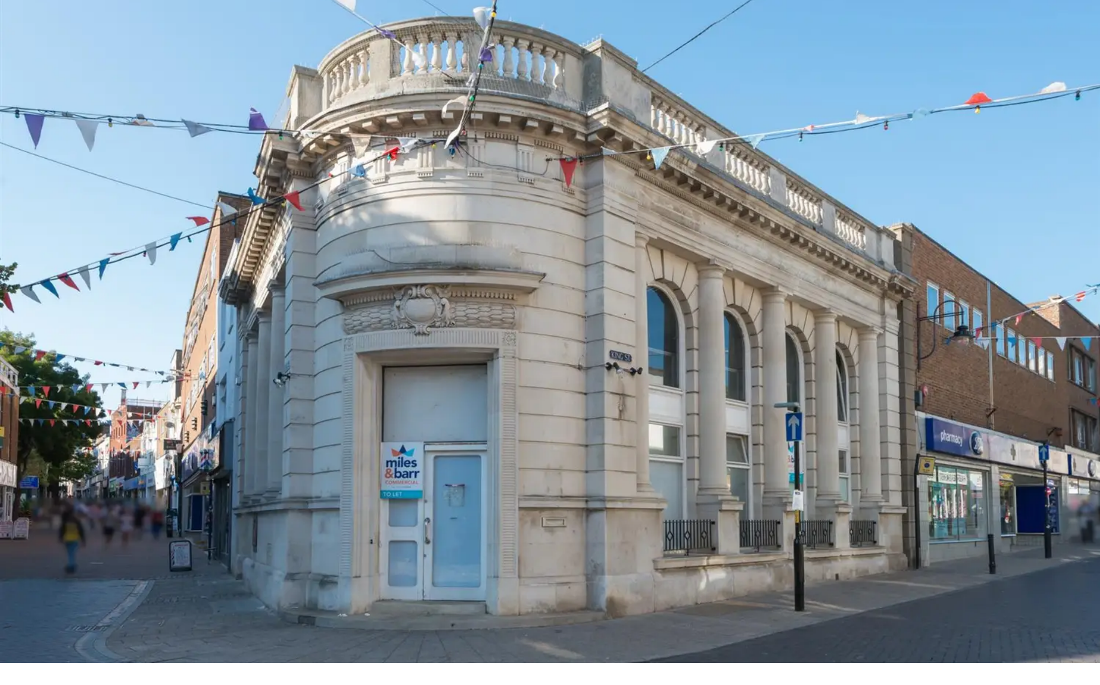
1-3 High Street, Ramsgate £2,916 pcm