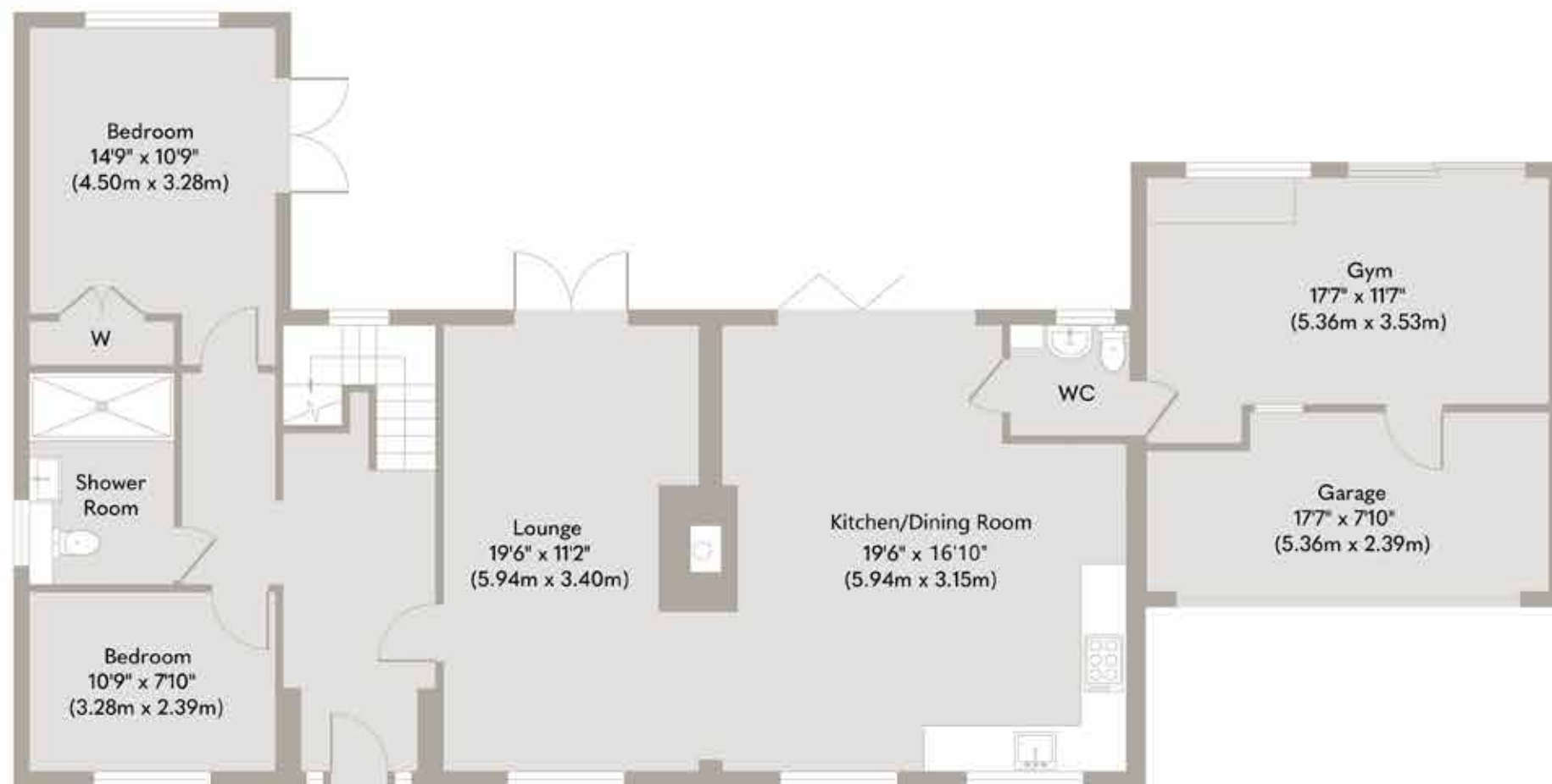
Ground Floor Approximate Floor Area 1542 sq. ft (131.42 sq. m)