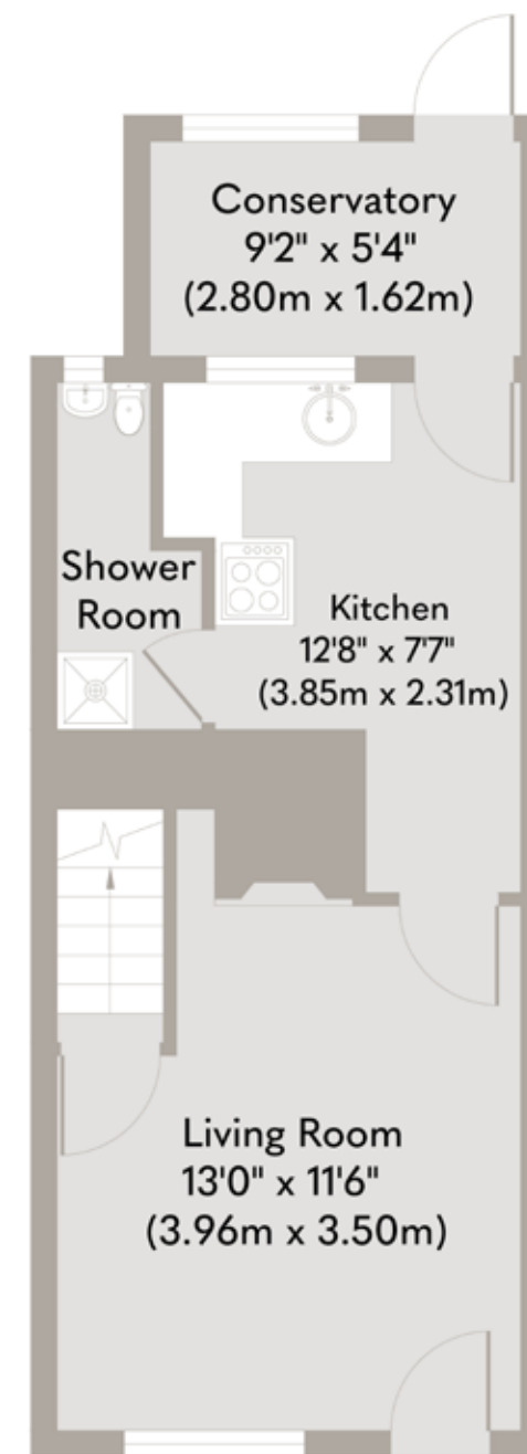
Ground Floor Approximate Floor Area 353 sq. ft (32.78 sq. m)