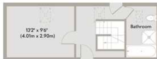
Second Floor Approximate Floor Area 292 sq. ft (27.09 sq. m)