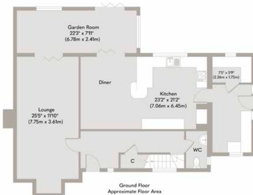
Ground Floor Approximate Floor Area 1,107 sq. ft (102.86 sq. m)