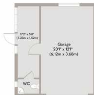
Garage Approximate Floor Area 350 sq. ft (32.49 sq. m)

Whilst every attempt has been made to ensure the accuracy of the floor plan contained here, measurements of doors, windows, rooms and any other items are approximate and no responsibility is taken for any error, omission, or mis-statement. This plan is for illustrative purposes only and should be used as such by any prospective purchaser or tenant. The services, systems and appliances shown have not been tested and no guarantee as to their operability or efficiency can be given.